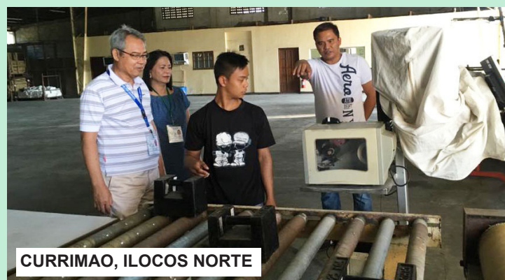
CURRIMAO, ILOCOS NORTE