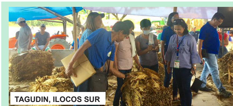
TAGUDIN, ILOCOS SUR

A total of P7.37 million was also given as production assistance to the farmer-cooperators of the AgriPinoy Hog Production Project this year. Hog production is a component of the NTA AgriPinoy Tobacco Farmers Food Processing and Trading Center, which was launched in 2013, as part of the income augmentation program of the agency. 🌱