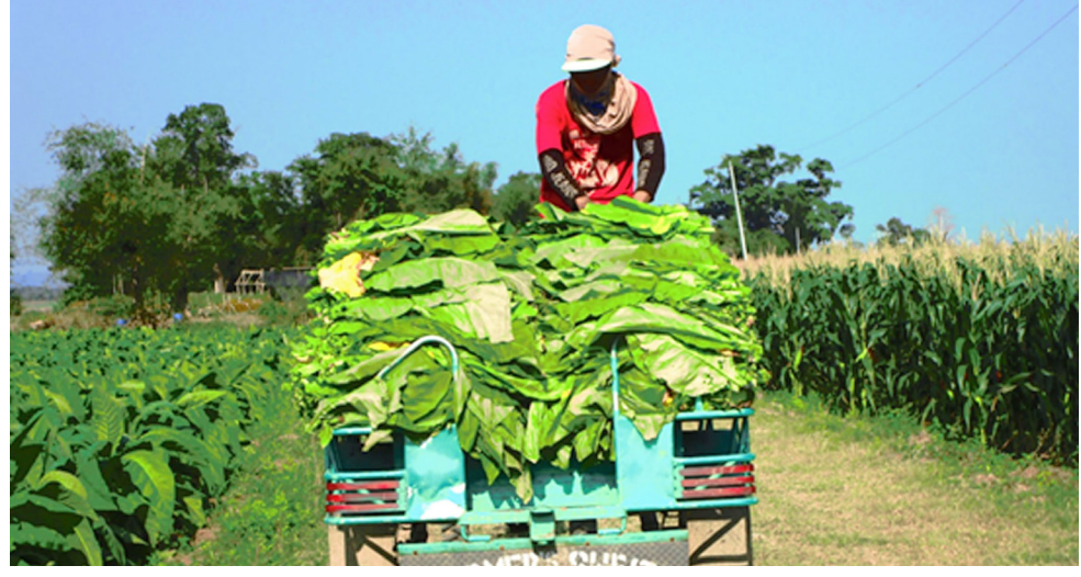
More income from tobacco production for local growers, including this hardworking Burley grower of Baccuit, Amulung, Cagayan, is assured with better production assistance package, increased subsidies, and reduced interest rates offered by the agency starting this current crop year.