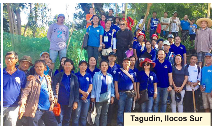
Tagudin, Ilocos Sur