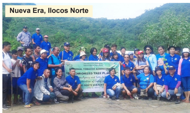
Nueva Era, Ilocos Norte

Tree seedlings were propagated in nurseries strategically located in selected areas across the district, from Nagbukel and Narvacan to Tagudin and Sta. Cruz and in the upland municipalities of Lidlidda, Salcedo, Gregorio del Pilar, and Quirino.